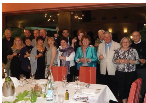
Farewell dinner at the Hotel Disio Resort in Marsala.