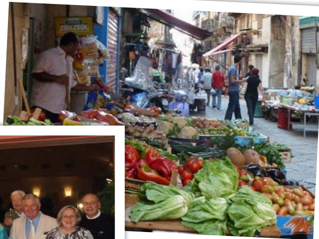
Campo market in Palermo.