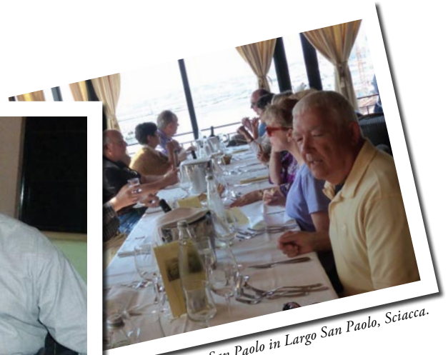
Lunch at Porto San Paolo in Largo San Paolo, Sciacca.