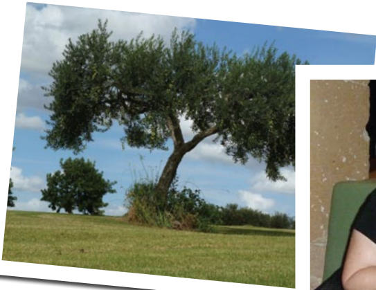
Olive tree at our resort in Ragusa.